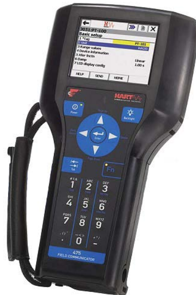
Figure 2 - Typical Field Communicator

The confusion arises around a device usually known as a communicator or, sometimes, a configurator. This device provides a user interface for the smart