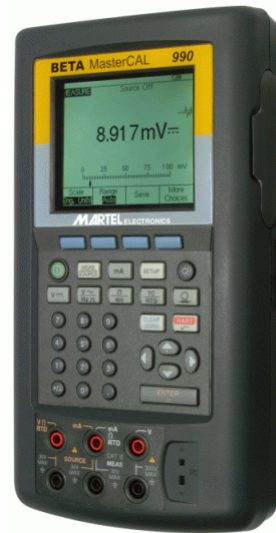
Figure 4 - Typical Smart Calibrator

Virtually all HART instruments support DAC trim using the universal command set. However, a significant percentage of instruments do not offer sensor trim using either universal or common practice commands. It is thought although not proven that a large majority of installed instruments (pressure and temperature transmitters, for example) do use the universal and common practice sensor trim commands.