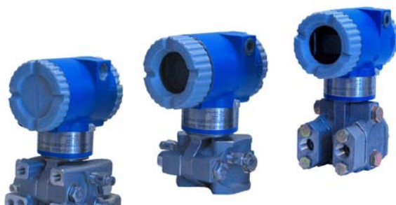
Figure 3 - Typical Smart Transmitters

Configuration generally means the adjustment of the measurement and / or transmission capabilities of a smart instrument to alter its function or use. For example, the measurement range of a thermocouple transmitter may be changed from 0 to 100 degrees Celsius to 0 to 200 degrees Celsius. This would not represent calibration unless a calibration device as defined above was used in the process to determine the accuracy with which it represents this change in its output. The term often applies to the use of a configurator or "electronic screwdriver" to alter the operation of a smart transmitter.